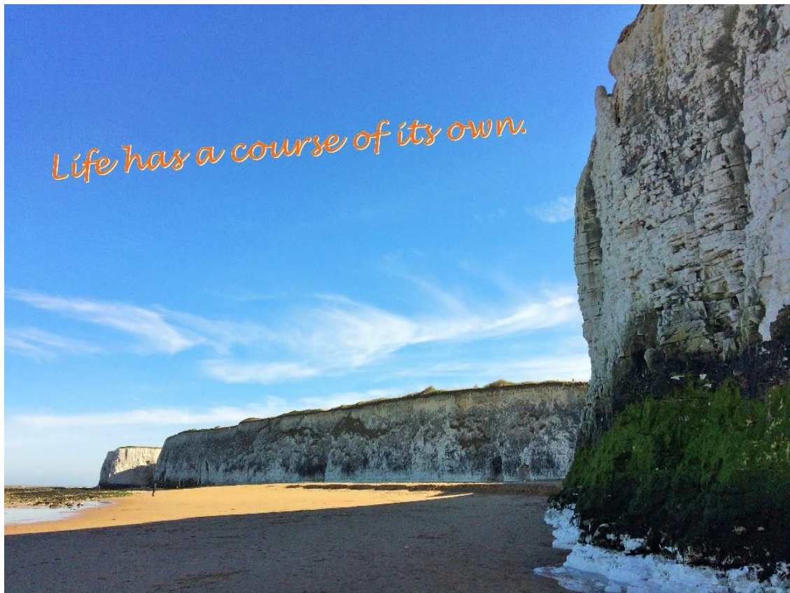
(英格蘭，肯特郡，布羅德斯泰爾 / Botany Bay, Broadstairs, Kent, England)

“Beautiful is what we see. More Beautiful is what we know, most Beautiful by far is what we don't” - Nicolas Steno (was a Danish scientist, who won world fame as a pioneer in both geologist and anatomist)