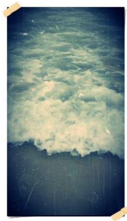
The darkest of my emotion

唔... 我可以想像，你現在也許直盯著我說：“你在呻吟什麼？” 沒有太多人想要知道你的問題、你人生、或對你感興趣！