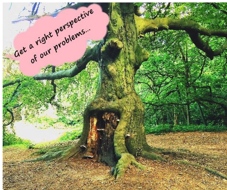
Hampstead Heath, North London