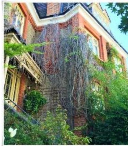
Dream house, anyone?

What an absolute B#S* ... yeah it's a pile of crap! I was so furious that I once again wasted hours of my life that I can't get back!!!