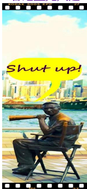
Avenue of Stars, Hong Kong